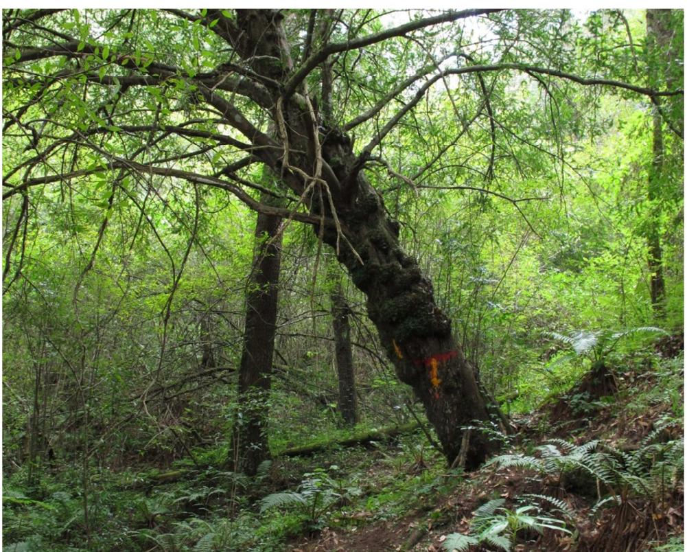
Figure 3. Female tree of T. globosa characterized in Sierra Gorda. Queretaro. Mexico.

managed by another communal group, different than that above, where the owner is aware of the environmental value of their surroundings.