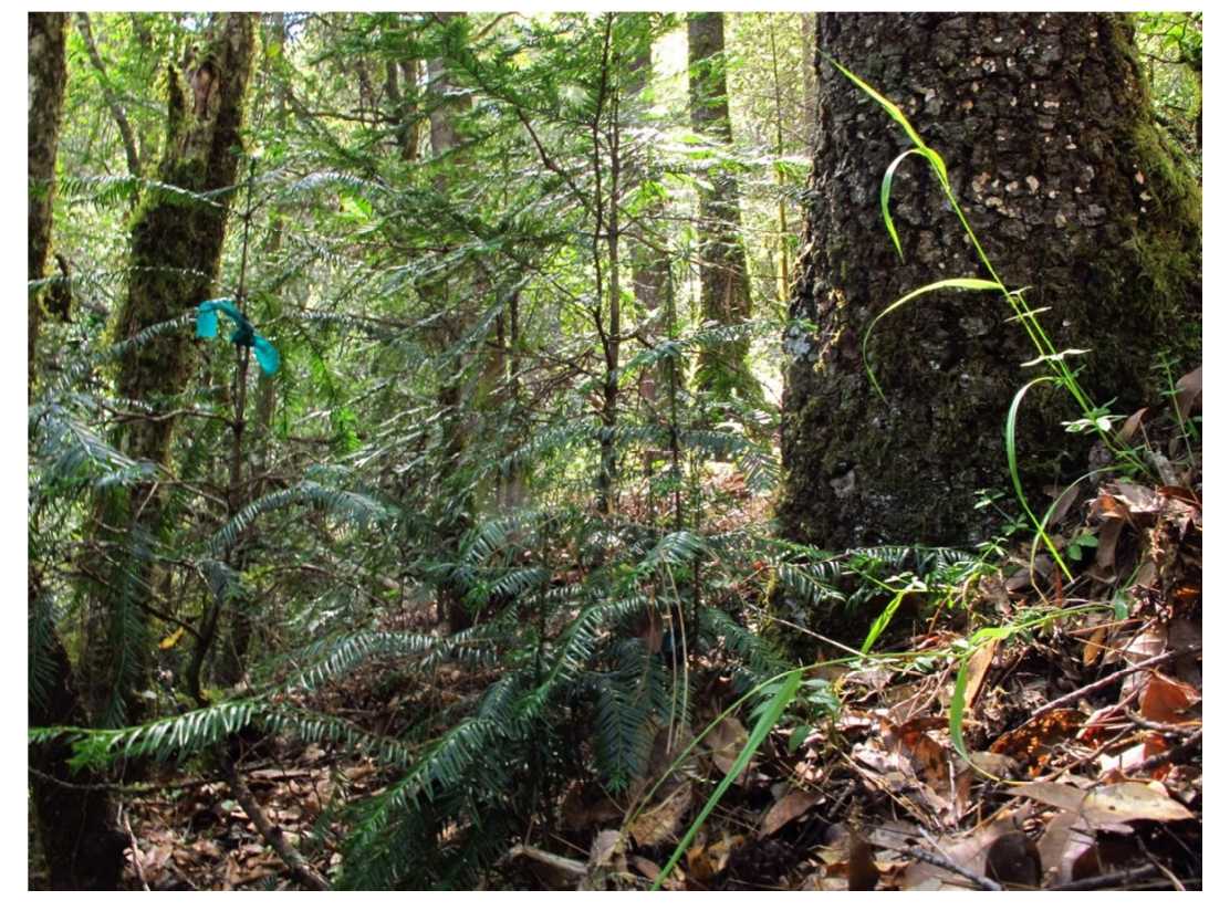
Figure 2. Juvenile yew growing beside an Abies religiosa. Promotion of hanger effect by the canopy individuals is very common in order to facilitate the recruitment of new plants.

rates. Thus, well-preserved, Mexican temperate forests are ecosystems with considerable capacity to shelter both forestresident birds and bird species migrating through the Americas. From observations at Las Tinajas Mountain, Bluebirds (Sialia currucoides) eating yew arils during the fall have been detected (pers.obs.), which is likely complemented by the presence of other Turdidae birds - a very important family for yew dispersal - such as the Aztec Thrush (Ridgwayia pinicola), the Brown-backed Solitaire (Myadestes occidentalis), the Black Thrush (Turdus infuscatus) and the Clay-colored Trush (Turdus grayi) which are present in northern forestland communities of the Sierra Madre Oriental [21]. It is unknown whether there is some involvement in T. globosa dispersal by terrestrial mammals (foxes, badgers, weasels, etc.). On the other hand, hydrochory dispersal events should not be ruled out, due to the sub-riparian character of the species. We have not detected mechanical protection systems provided by other species (plant-plant mutualistic interactions) acting over young yew seedlings existing in the prospected area sensu García & Obeso [18].